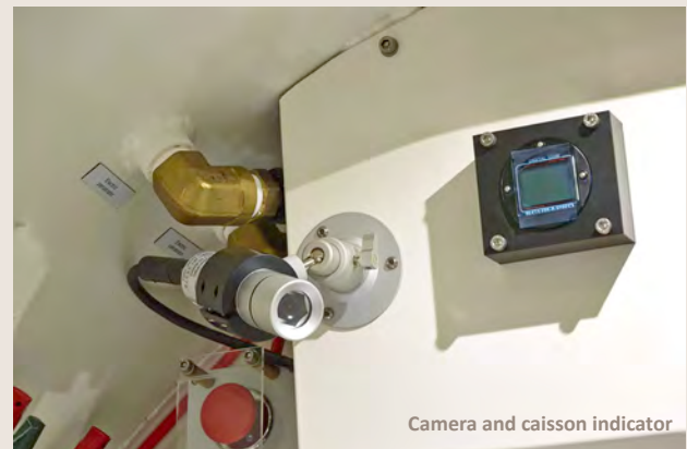
Camera and caisson indicator