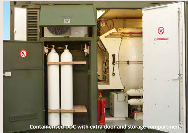
Containerised DDC with extra door and storage compartment