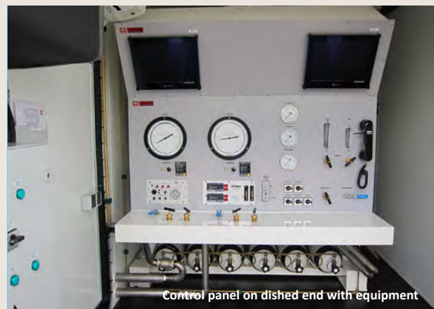
Control panel on dished end with equipment